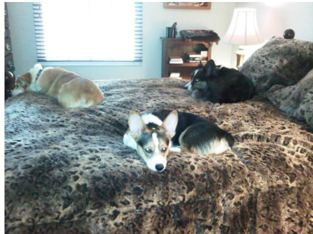
"Mommy ... they're ignoring me again ... sigh."