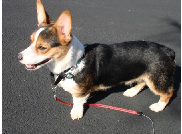
Buster, the Rescue Corgi